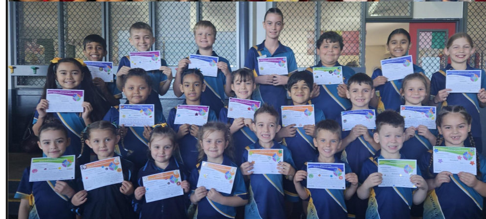
Social & Emotional Learning Award recipients—some children had 4L commitments prior to the main photo.