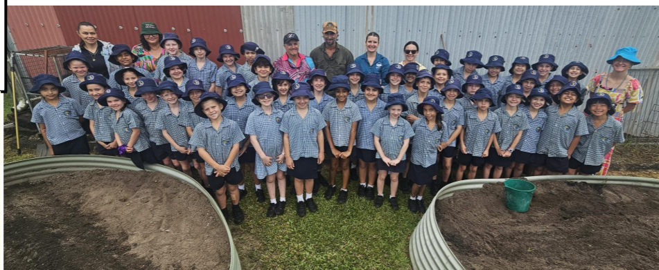
Sweetest Schools Competition—sugar-cane billets planted by Yr 4 today in the school garden. More photos and details available on the Good Counsel Primary's Facebook.

Please join us on Friday as our First Nations students share their prayer assembly. Each year, National Reconciliation Week is celebrated from 27 May to 3 June. National Reconciliation Week marks an important opportunity for us to come together to commemorate and celebrate Aboriginal and Torres Strait Islander culture and heritage, and reflect upon the significant changes in our history for the betterment of Australia's First Nations' peoples. This year's theme, All In, calls on us to reflect on meaningful actions they can take to support reconciliation as part of our everyday lives. https://www.qld.gov.au/firstnations/cultural-awareness