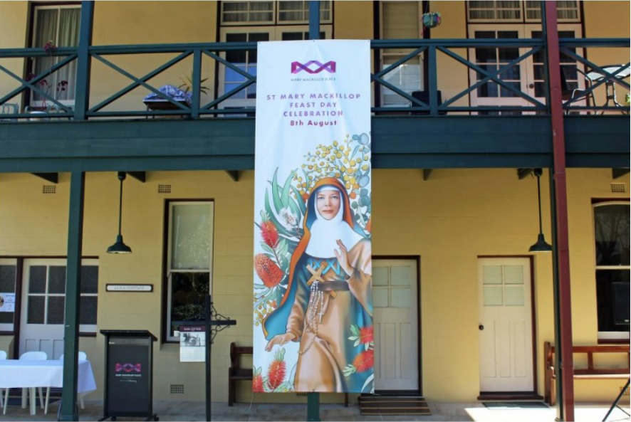
Mary MacKillop Place, the Sisters of Saint Joseph and Mary MacKillop Today extend a warm invitation to celebrate the Feast Day of Saint Mary of the Cross MacKillop on Friday, 8 August 2025.