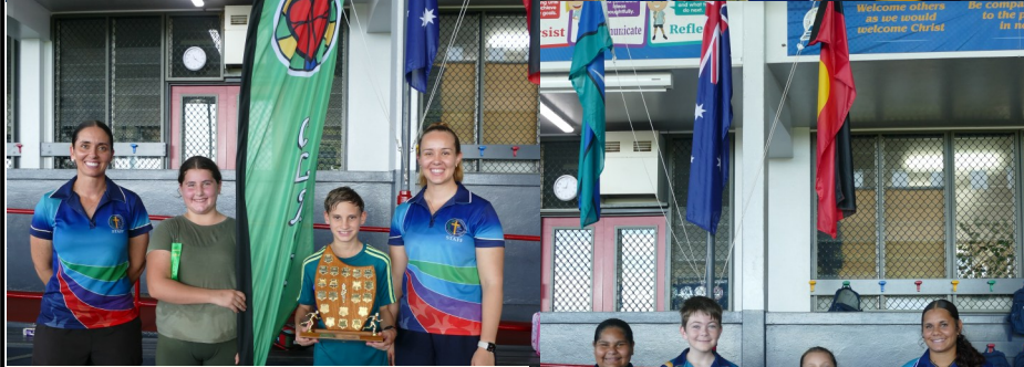
Cross Country Lap Running: Clancy House Cross Country Winners—Polding House