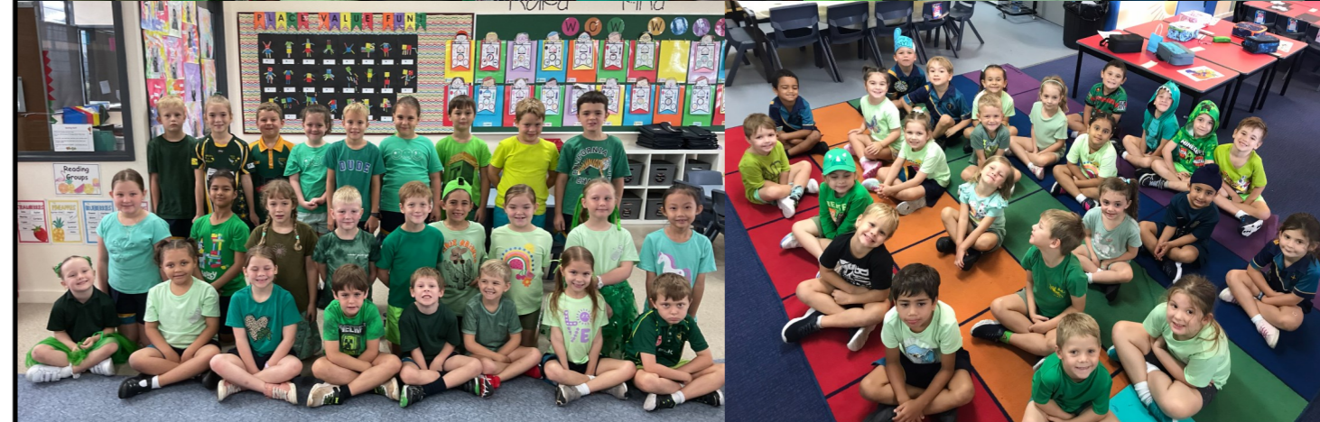
Green day for St Patrick in all classrooms on Friday.