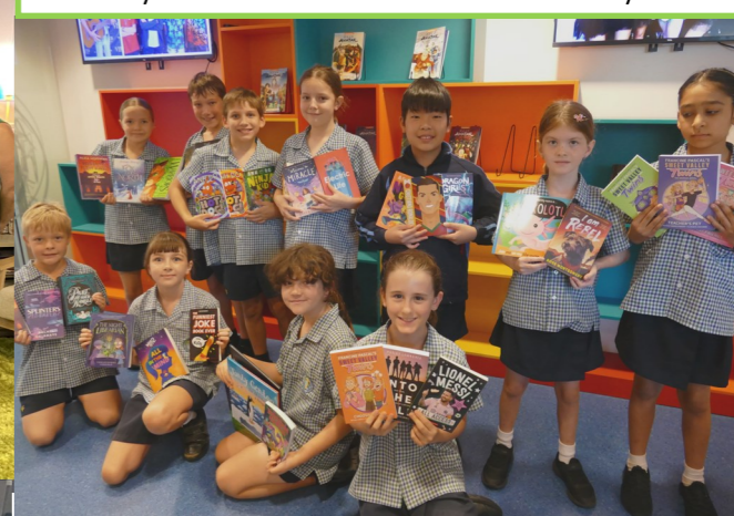
More books for the Library—courtesy of the Book Fair.