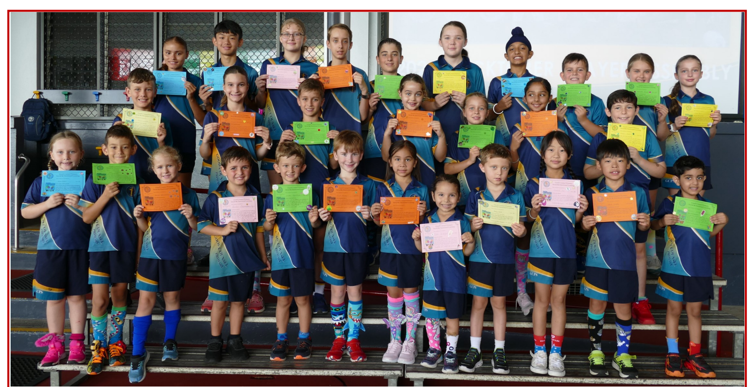
Congratulations to Week 3's SEL award recipients