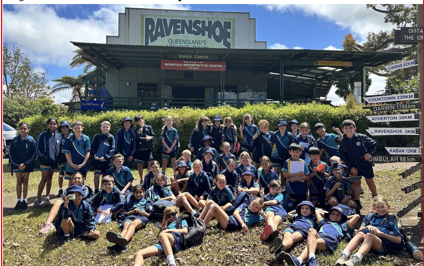
Year 4 excursion...