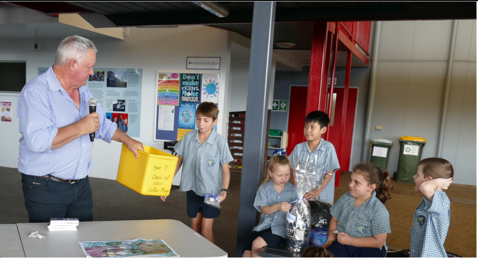
FATHER’S DAY RAFFLE—WINNERS ARE GRINNERS—CONGRATULATIONS!