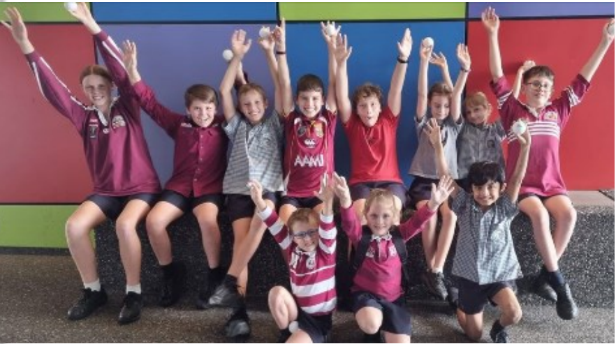
Congratulations to last week’s State of Origin Lucky Door Prize winners.