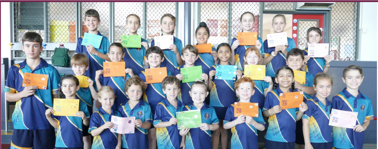
Week 8 Social & Emotional Awards and Field Events.