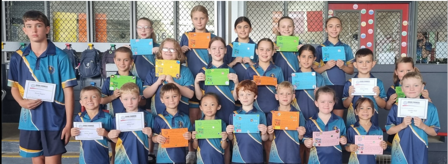
Above: Wk 1 Social and Emotional Award Recipients—Friday 19 April