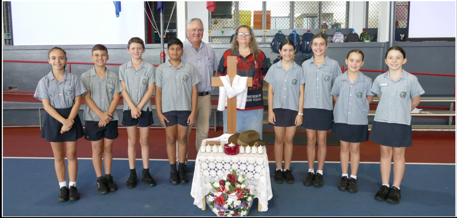
Below: Student Council’s ANZAC Assembly—