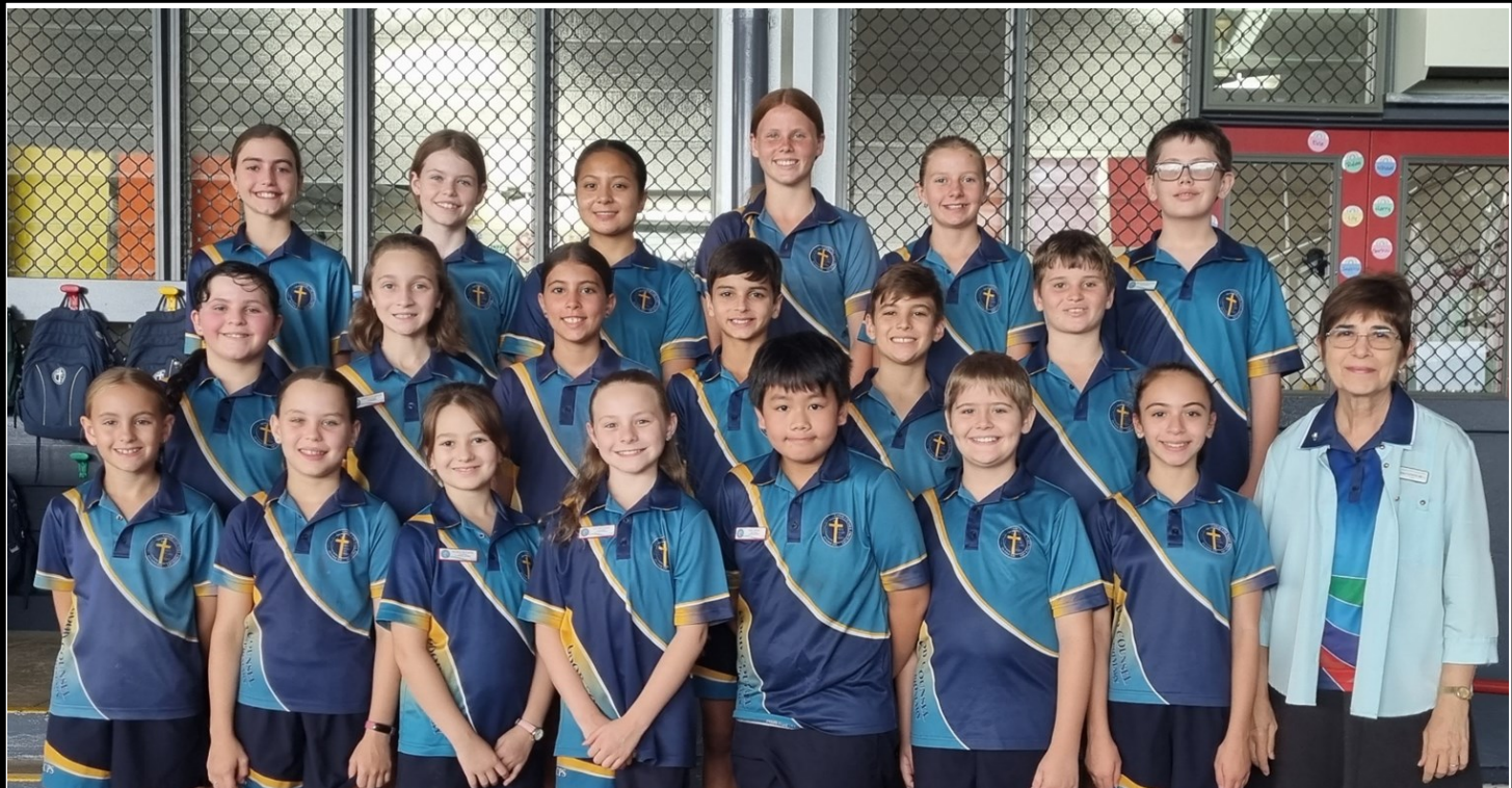
Above: Mini Vinnies for the New Life Prayer Assembly—Friday 19 April

Rain is Grace; rain is the sky descending to the Earth; without rain, there would be no life. John Updike