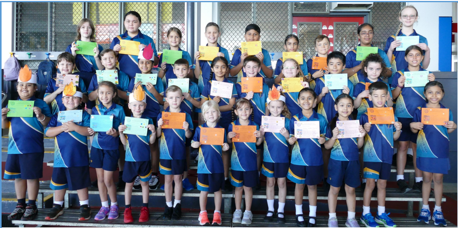
Fire Education with Yr 1—Visit #2. Thank you to the Innisfail Fire and Rescue Team for taking the time to explain to the children.