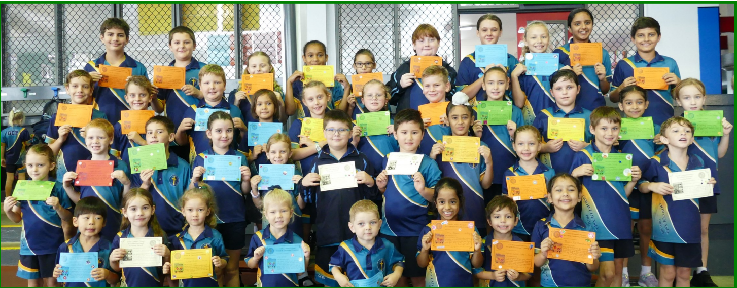
GCPS GREEN DISCO—MANY HANDS MADE LIGHT WORK—THANK YOU!