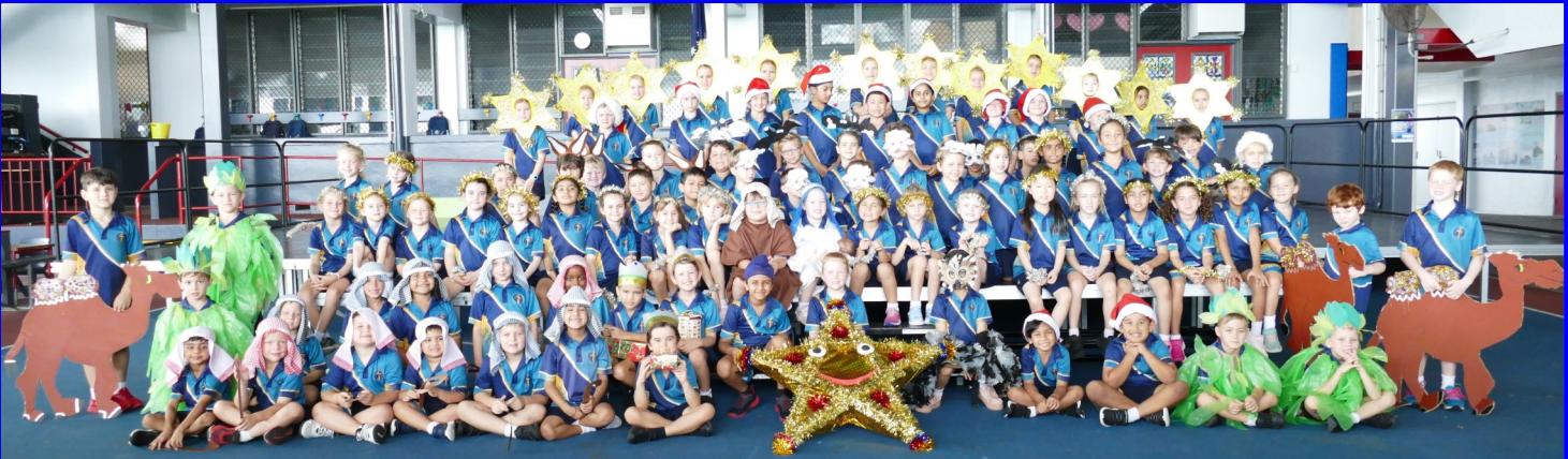
Prep and Yr 1 Christmas Presentation with the Class Hampers and the ‘Three Wise Men’.