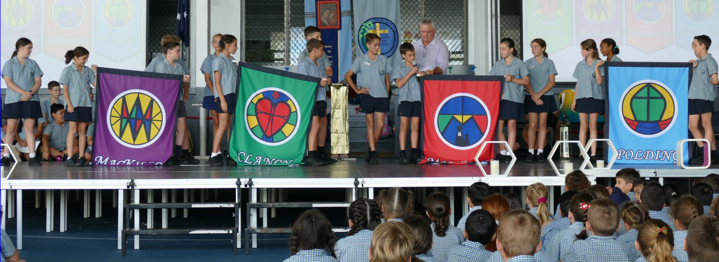
Graduation—Yr 6 Class of 2021