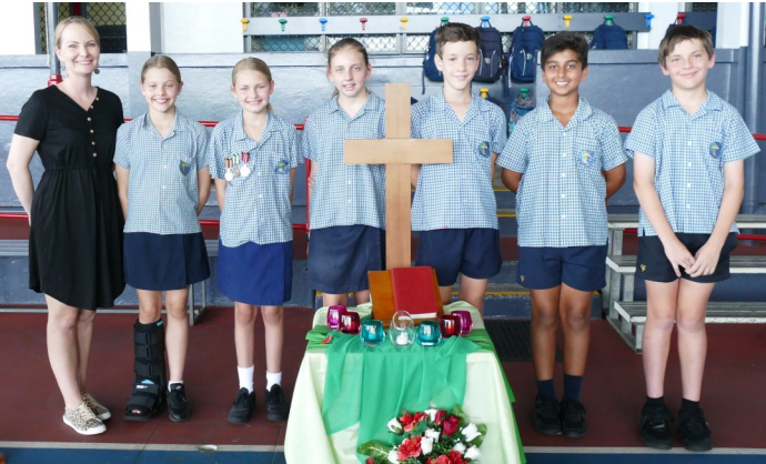
At the same time, at school, the staff and students held a solemn commemoration of their own.

This week the GCPS ‘World Cup Soccer’ winds down with various finals; Handball Competitions get into full swing; Billy Slater League Tag Day on Friday for Yr 5 and 6 at Callendar Park.