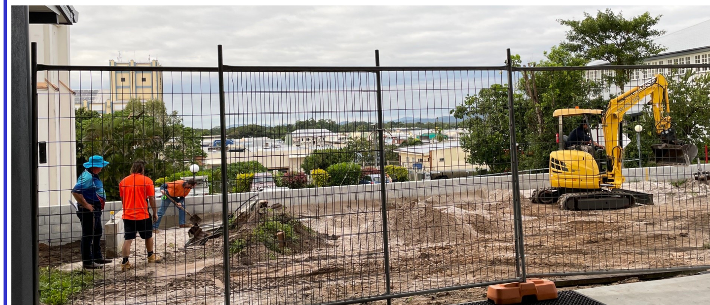
The changing landscape of the Prep playground area. Fabulous P&F initiative in progress—thank you!