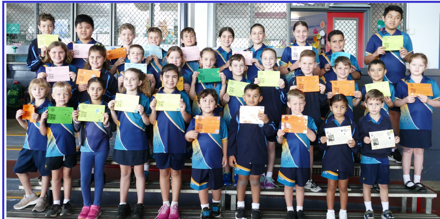
Social and Emotional Learning Awards for Week 8.