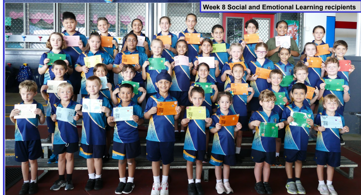
Week 8 Social and Emotional Learning recipients