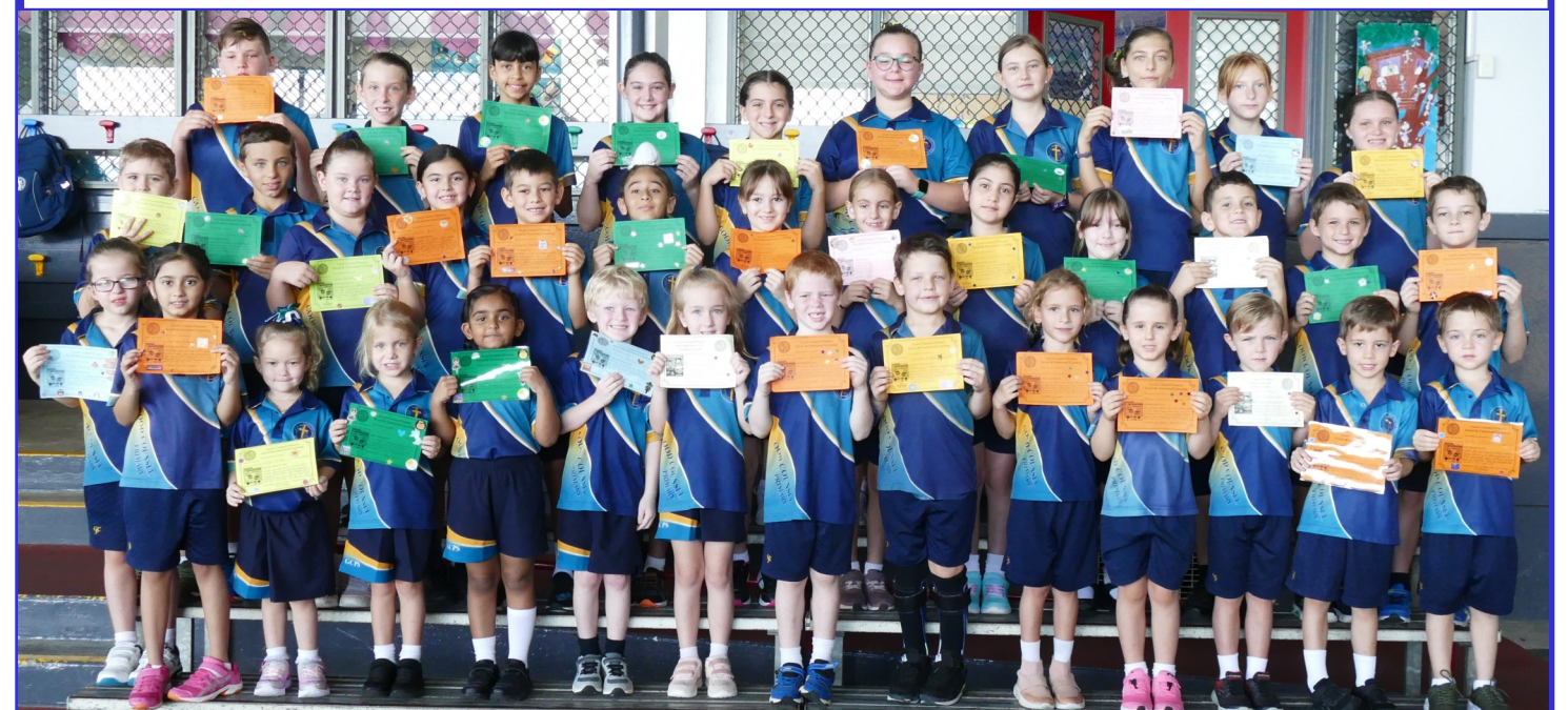
Week 7 Social and Emotional Learning recipients