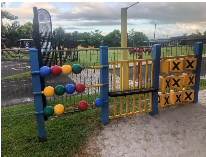
COMPONENT 3 - Sensory wall

We are hoping to remove the equipment by Week 4 of next term to prepare the site for a June holiday installation of the new equipment.