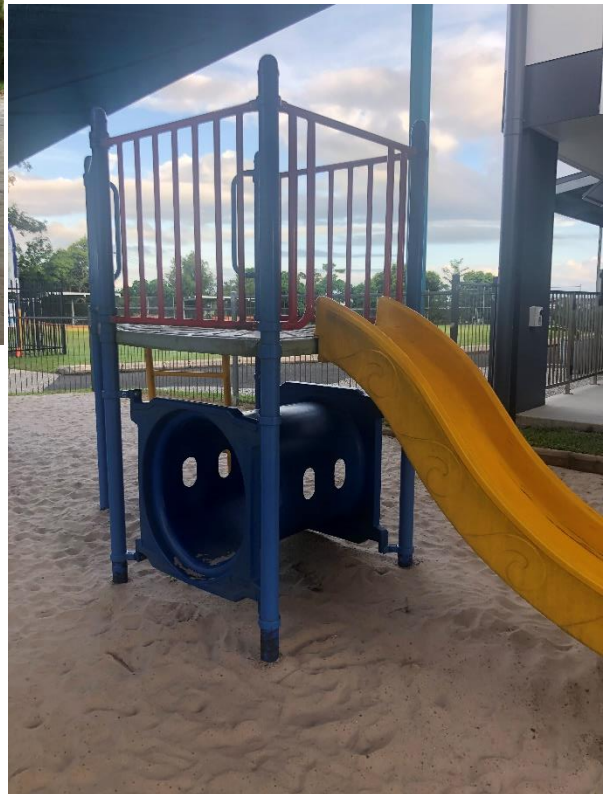
COMPONENT 2 - Yellow slide, tunnel, platform and ladder