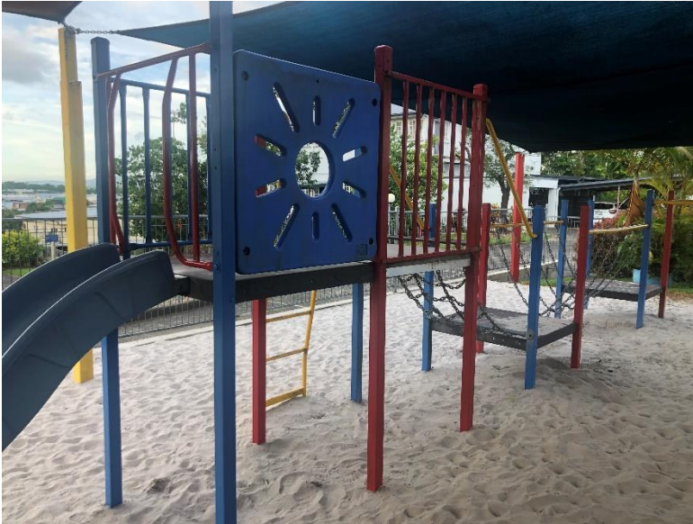
COMPONENT 1 - High platform, blue slide, ladder, chain bridges, three low platforms and monkey bars

If you are interested in re-utilizing the equipment for home use, it will be sold 'as is' and in the condition it is once removed. The equipment will be sold as three separate components.