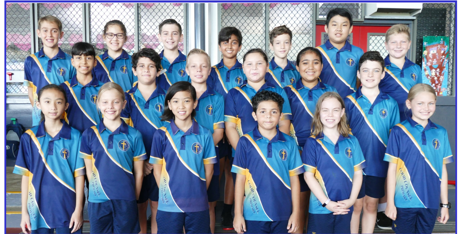
Harmony Day Prayer Assembly—Everyone Belongs

Prep—6 year old 500m 7—8 year old 1km 8—10 year old 2km 11—12 year old 3km