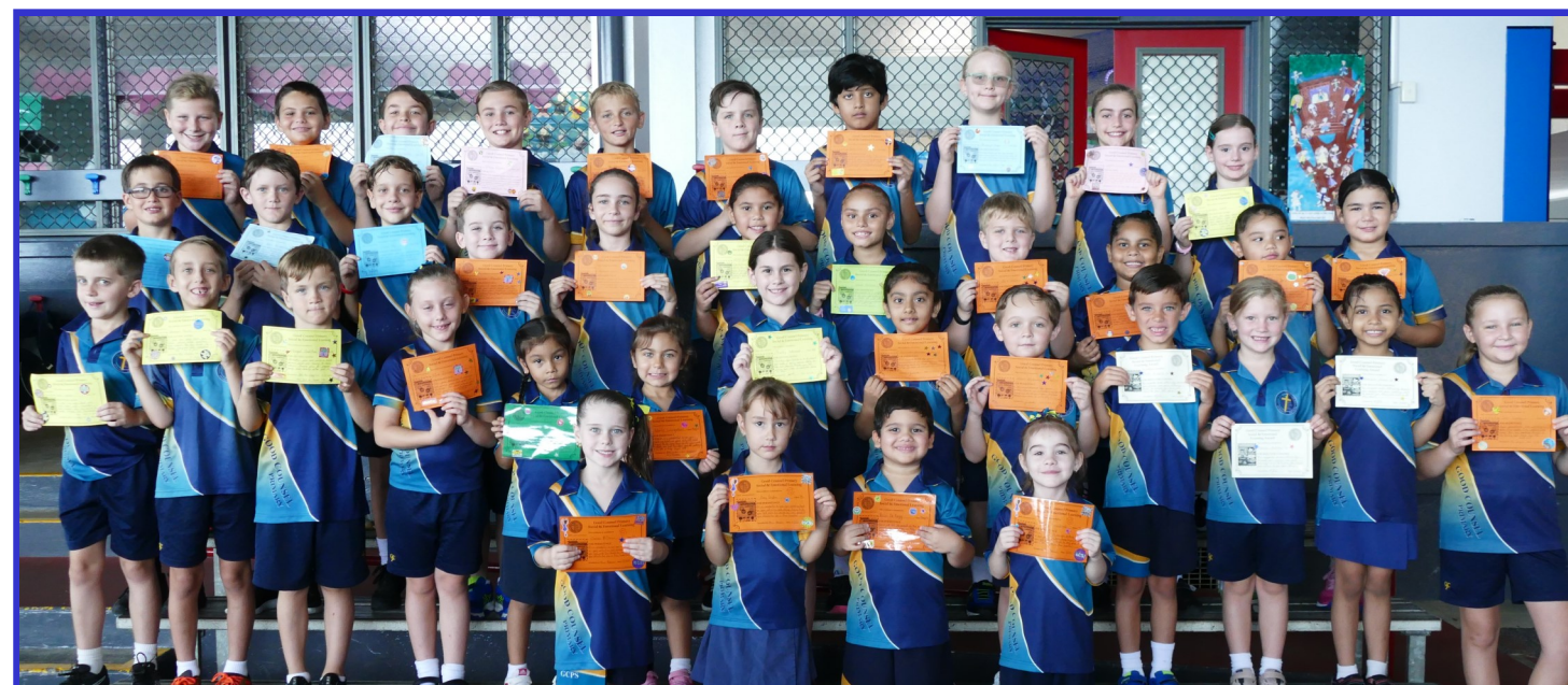
Week 6 Social and Emotional Learning recipients

Cross Country Distances: Prep—6 year old 500m 7—8 year old 1km 8—10 year old 2km 11—12 year old 3km