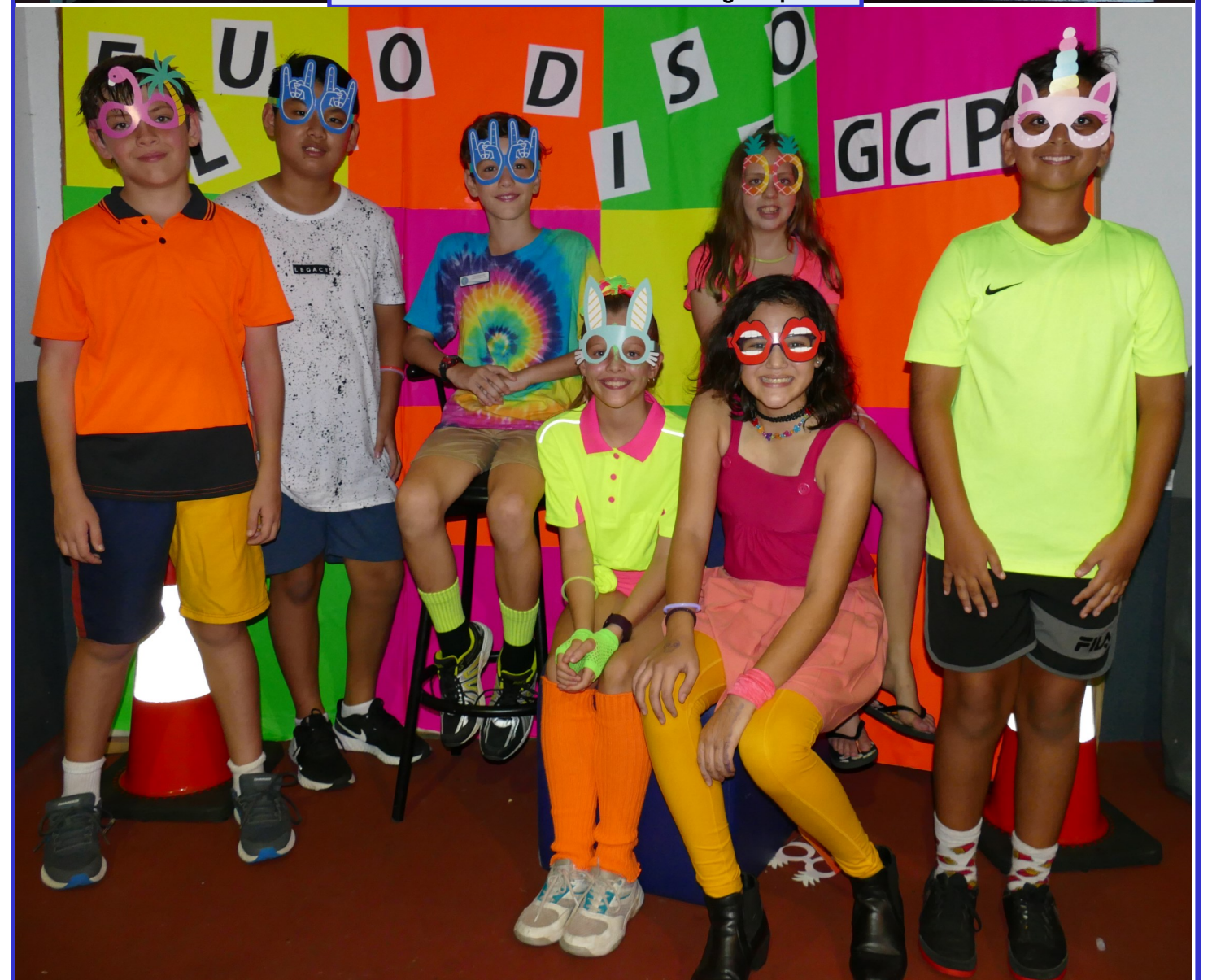
FLUORO DISCO—Congratulations Student Council on a job well done.