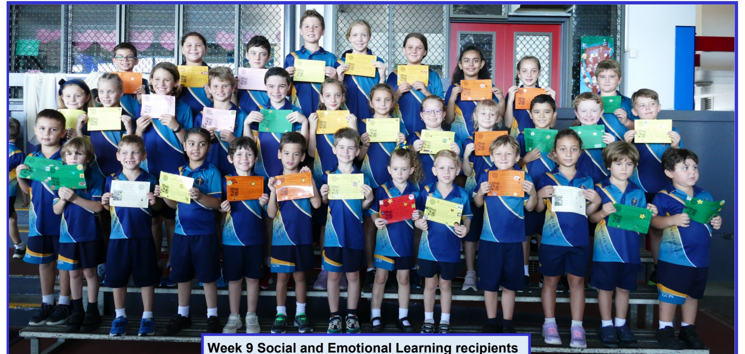
Week 9 Social and Emotional Learning recipients