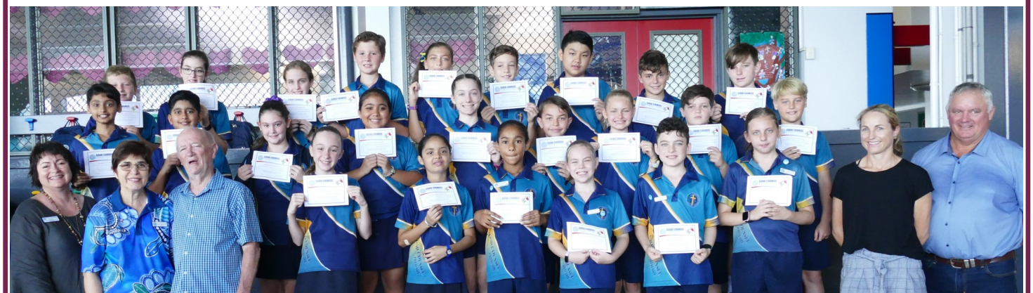
GCPS 2021 6S Mini Vinnies Class Executive