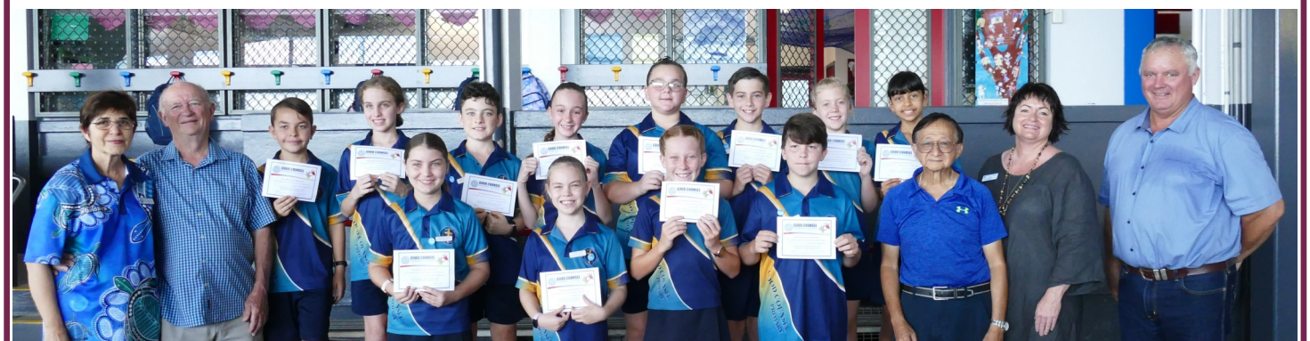
GCPS 2021 6H Mini Vinnies Class Executive