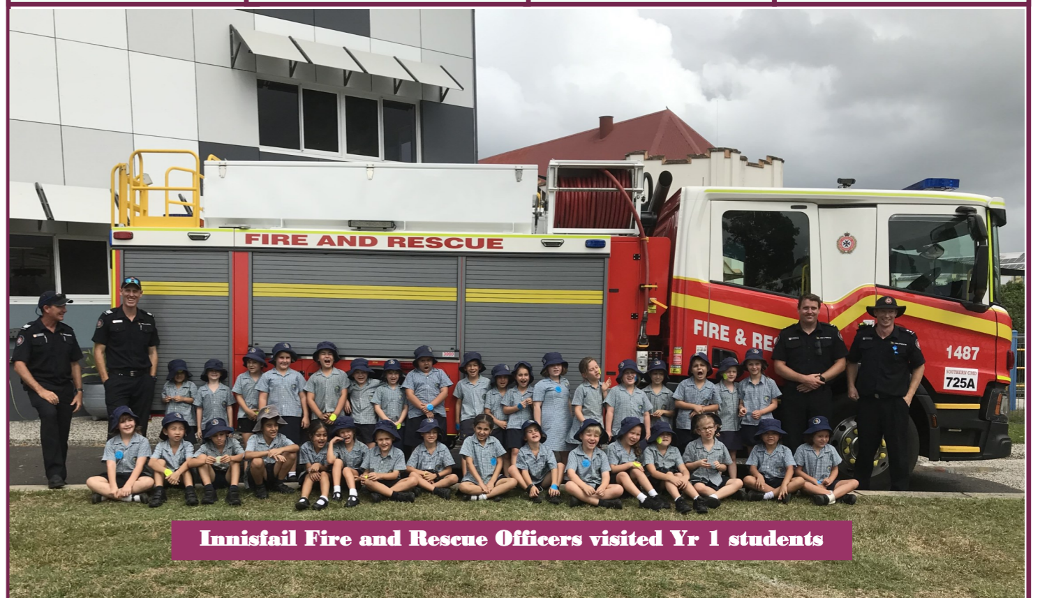
Innisfail Fire and Rescue Officers visited Yr 1 students