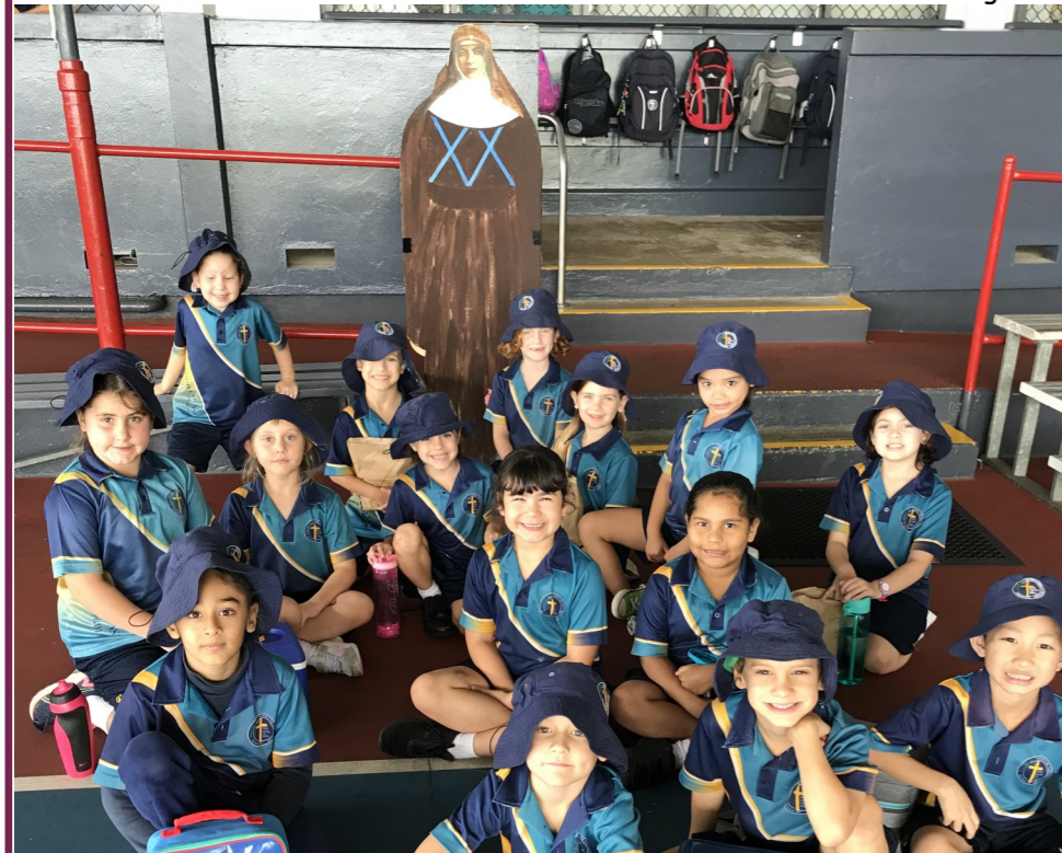
All classes, including 16 students above, remembered to honour Saint Mary of the Cross with a prayer presentation on Friday.