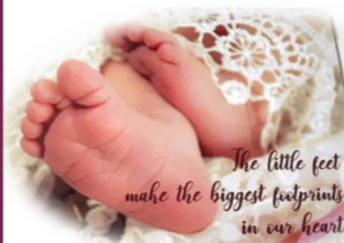
The little feet make the biggest footprints in our heart.