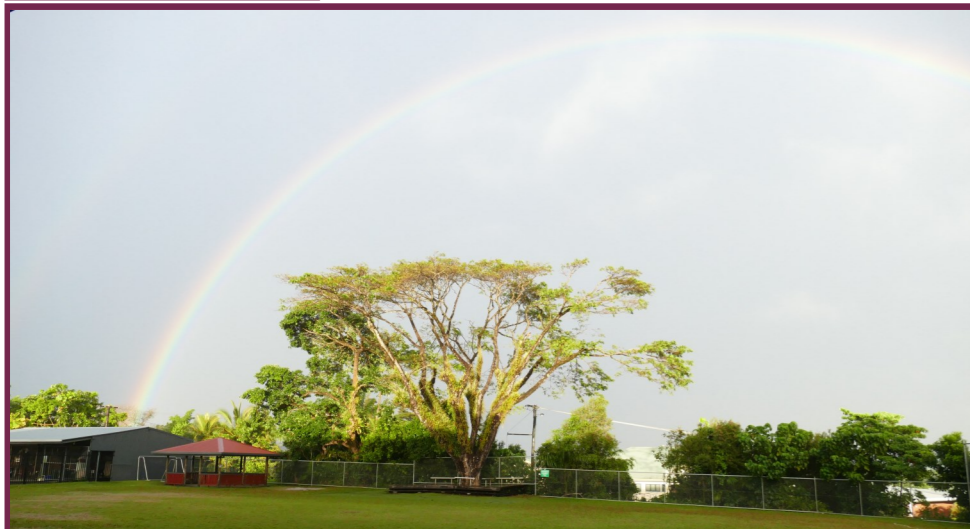
"Nature follows—as she takes her course—the Divine Intellect and the Divine Art." Dante Alighieri