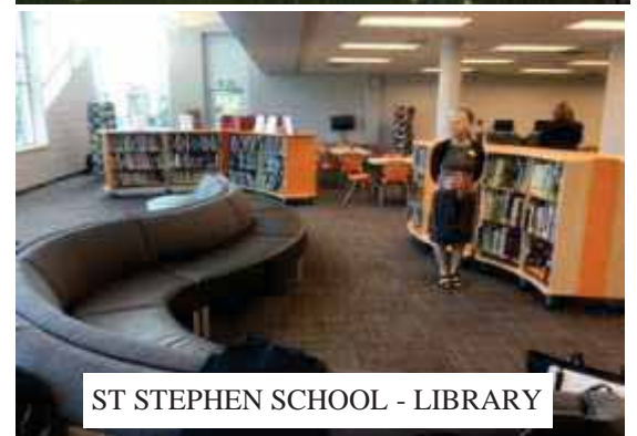
ST STEPHEN SCHOOL - LIBRARY