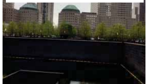
9/11 WORLD TRADE CENTRE MONUMENT