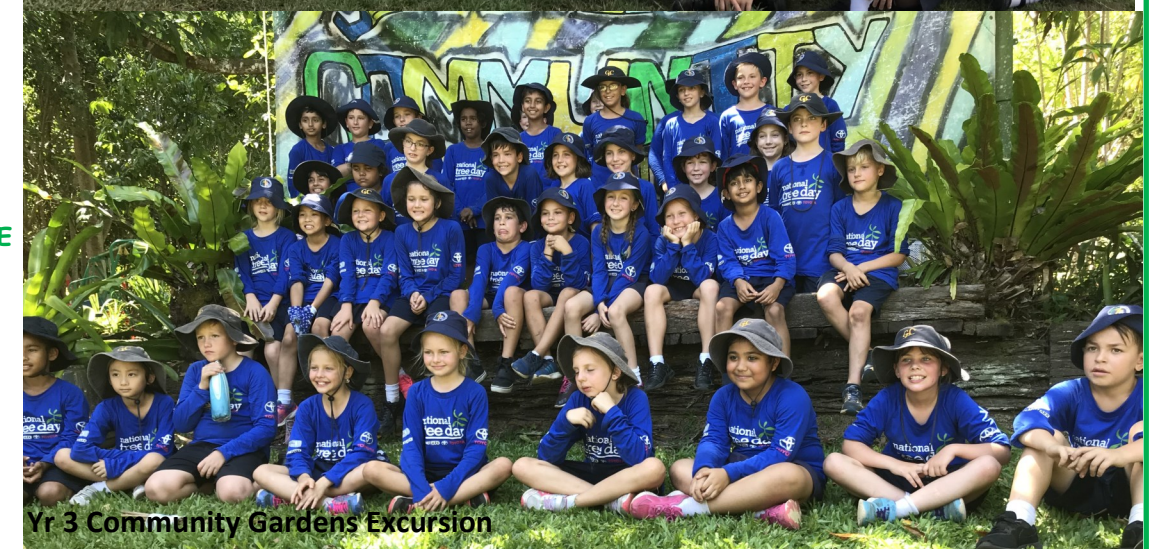
Yr 3 Community Gardens Excursion