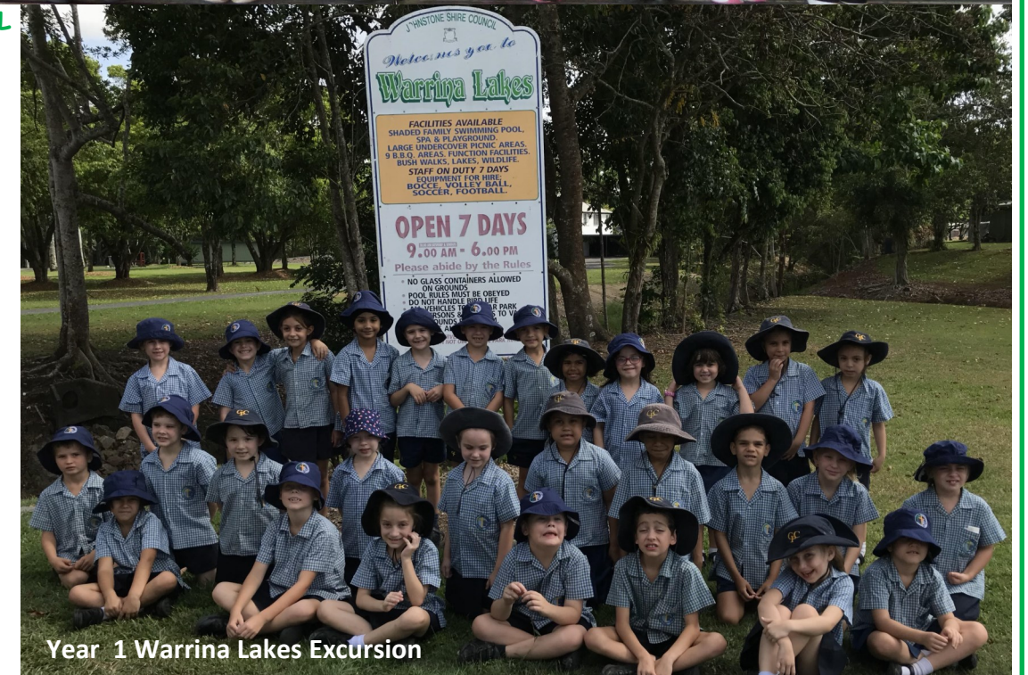
Year 1 Warrina Lakes Excursion