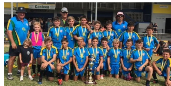
GCPS Boys Rugby League Team - Winners of the Jim Graham Cup

All children have returned after the break and have been focussed on their learning. Behaviour at school has been exceptional, let us hope this continues over the next 8 weeks leading into the Christmas break.