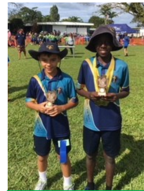
Innisfail District Age Champions 2018

Good Luck to the students who have been selected in the Athletics Innisfail District team for the Peninsula Championships at Barlow Park Cairns this Sunday and Monday.