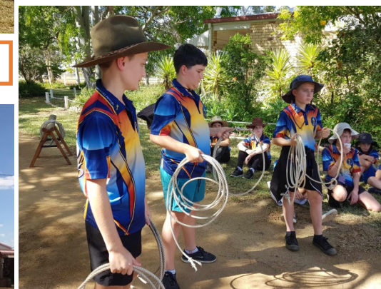
TRYING OUR HAND AT LASOING