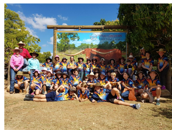
TEXAS LONGHORN STATION