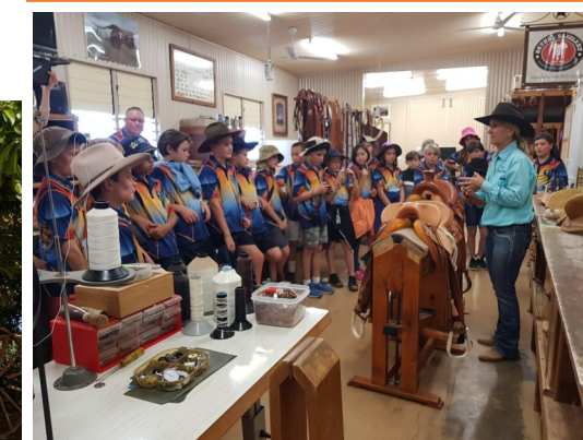
VISIT TO SADDLERY SHOP