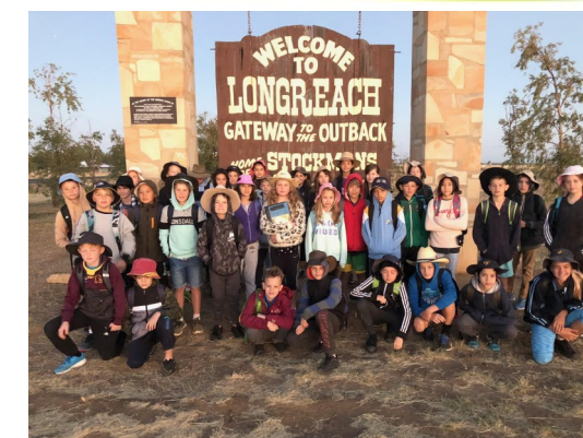
GATEWAY TO LONGREACH