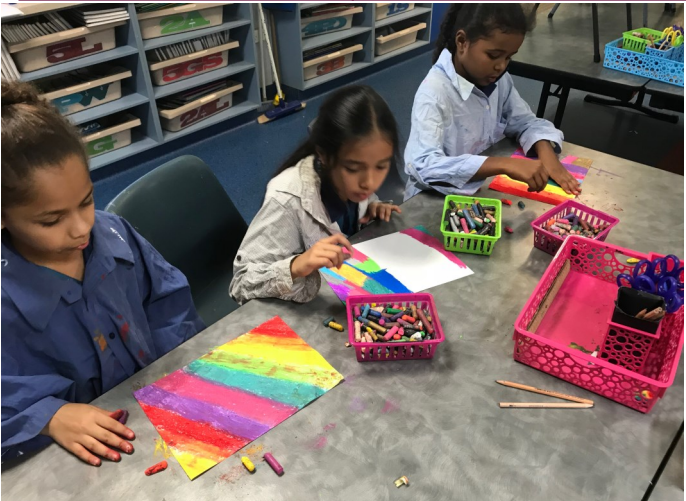
4B - ART TIME