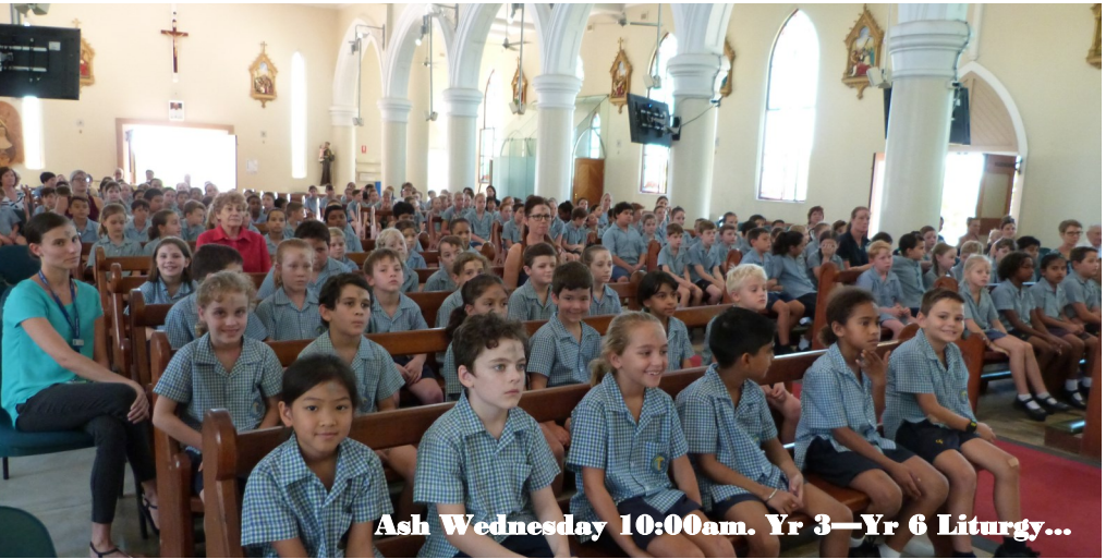
Ash Wednesday 10:00am. Yr 3—Yr 6 Liturgy...

Small bookcases and desks suitable for kids playroom. 40 plastic chairs with steel base suitable for shed/party area— See Liam at school.