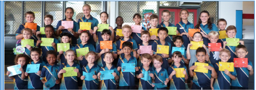
Final SEL Awards for Term 1. Congratulations to everyone who has put their skills to good use throughout the term.

On this evening, the Paschal candle is blessed and lit for the first time. It will be used throughout the Easter season and at baptisms until next Easter when a new candle is blessed. The Paschal Candle has the symbols of Jesus on it: a cross, the first and last letters of the Greek alphabet (alpha and omega) symbolising that Christ is our beginning and end, and the current year showing that Christ is the Lord of our time.