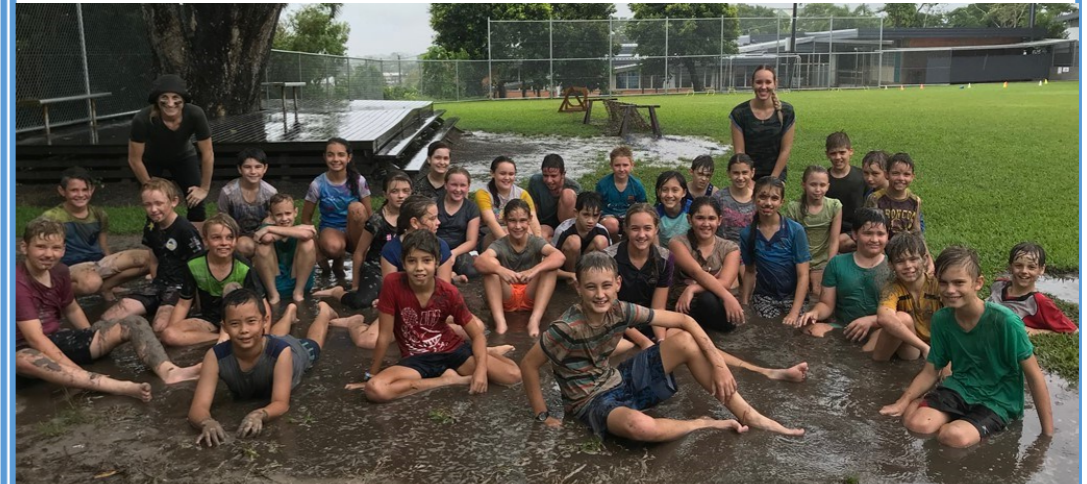
Year 6 enjoying their Obsta-thon efforts to raise money for Project Compassion.