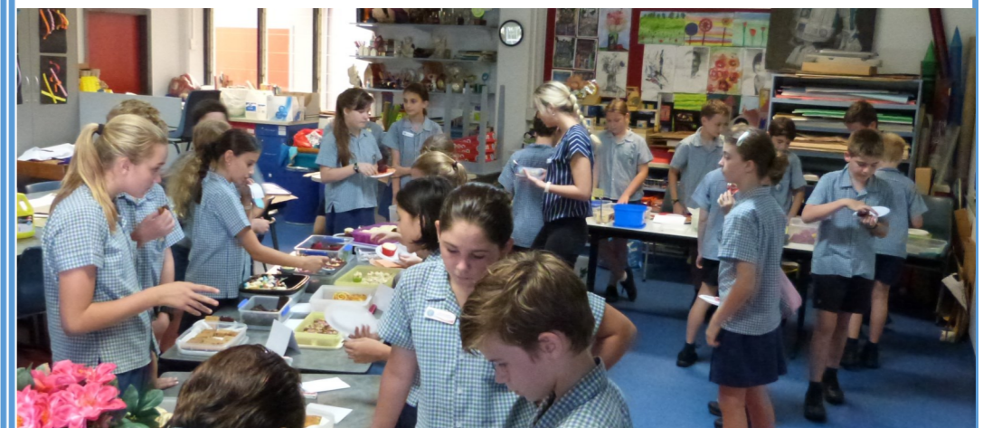
Putting into place their plans from the Caritas Just Leadership Day, Year 6 sell fabulous goodies.