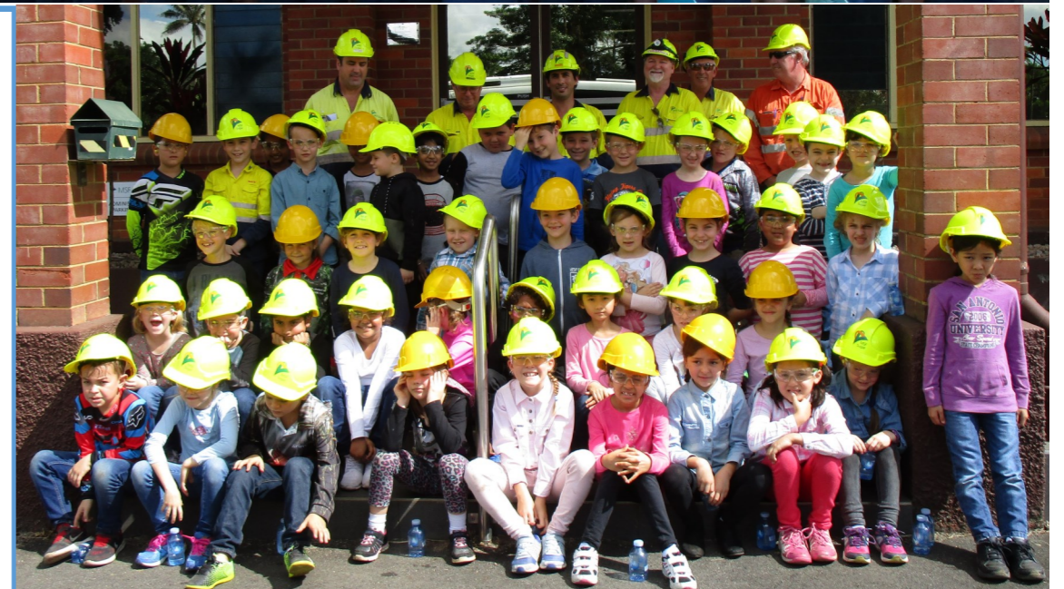
Yr 2 visit to South Johnstone Sugar Mill Book Character Parade—Preps & Year Ones, Year 5 & Year 6 students. Congratulations to everyone who dressed in character. You looked fantastic.