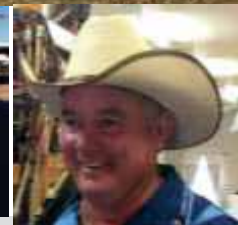
Postcards from Longreach & Main Street Winton